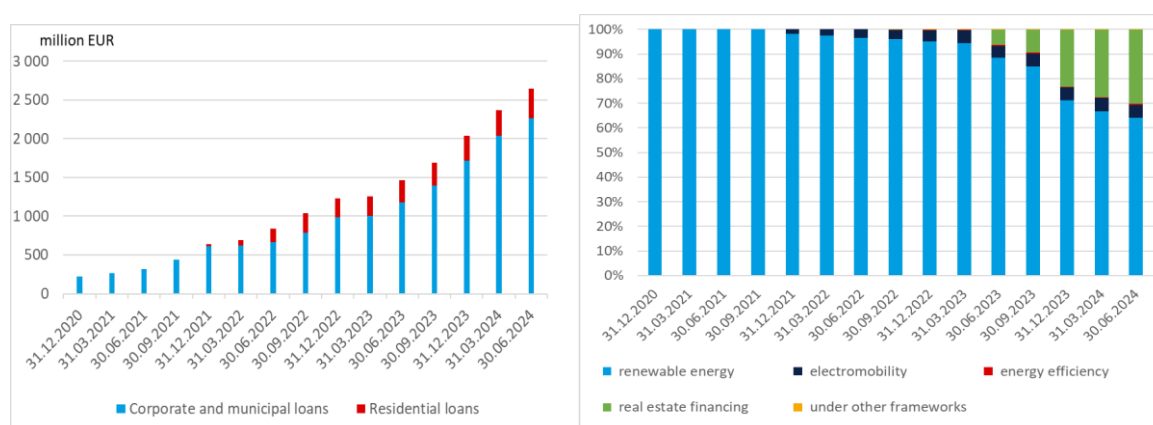
Figure 3: Evolution of GPCRP (left hand) and the composition of corporate loans (right hand)